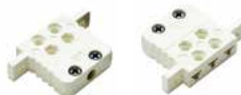
Miniature socket panel